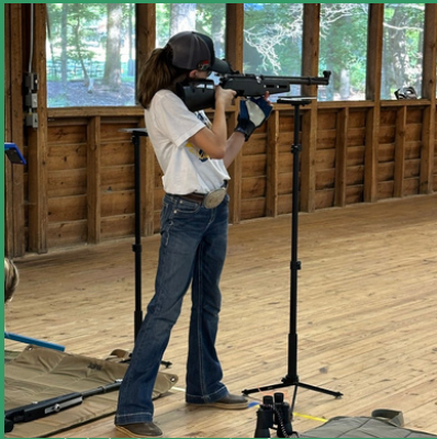
Randolph County 4-H'er competes in the Central Region 4-H Shooting Sports Competition.